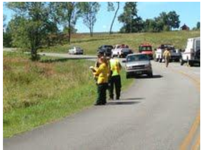
Fire personnel taking weather observations during the prescribed burn. □

By the early afternoon, all of the favorable meteorological variables were in place. Temperatures had warmed to nearly 70° F, winds were 3-7 mph, and humidity values were around 40%. Despite these conditions, a fire could not be started as the fuel moisture had remained too high. The fuel (grass) was also too “green”, with very little cured fuels available, hindering ignition. The long-term soil moisture anomaly was also high, helping to keep the fuel moisture high. Perhaps if the winds had been a little stronger in the morning, the dew might have evaporated quicker, helping the fuel moisture to lower, and thus increasing the burn potential. Regardless of the outcome, prescribed burns such as the one that was attempted at the Saratoga NHP on September 6 show how crucial a role meteorology plays in fire behavior.