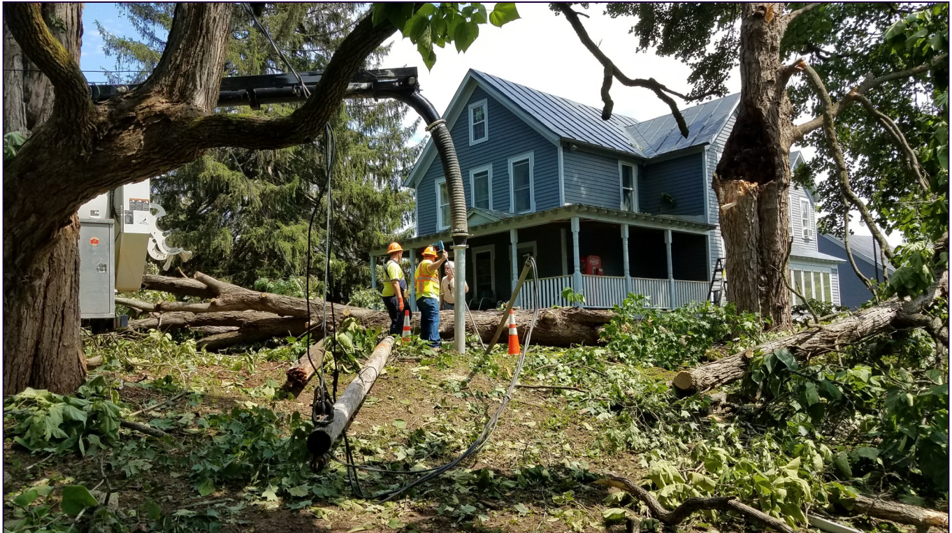
Figure 1: Damage near a home east of Saratoga Springs, NY. Trees were snapped or uprooted.

Overall, it was a fairly average year for tornado occurrences across eastern New York and western New England with the three that were recorded. It was unusual that they all occurred on one day. Two of the tornadoes were EF-1's with minimal extensive damage. It will be interesting if 2020 ends up being an above or below average year for tornadoes in the Albany Forecast area.