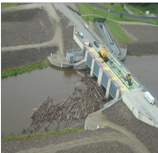
Debris backed up behind the Chena Flood Control Project. The Army Corps of Engineers operated the dam and controlled the flow of the Chena River for approximately 24 hours.

Outside of the Fairbanks North Star Borough, much of the city of Nenana was completely inundated and many residences and businesses received damage. Submerged tracks and a washout of the Alaska Railroad forced officials to cancel passenger and freight service between Denali Park and Fairbanks for several days. Persistent wet weather after the initial surge of water resulted in a very slow recession of floodwaters and some locations were inundated for up to a week after the initial event. Preliminary estimates indicate that Nenana alone received nearly $2.5 million in damages during this event.