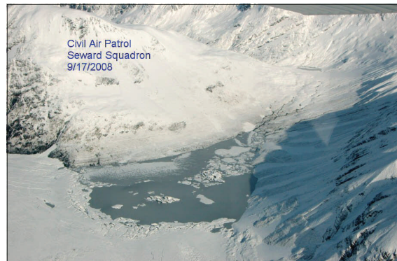
The Skilak Glacier Dammed Lake is located in the Harding Ice Field above the Skilak River. The lake typically releases in the late fall every two years and typically causes a 1-4 foot rise in the Kenai River below Skilak Lake. The photo above gives us an estimated water level rise of 25 feet from photos taken a month ago. There is no established target breakout water level, but it appears to be approaching a level at which it is likely to release. A fall 2008 release is very likely.