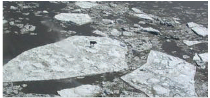
US Fish & Wildlife pilot Brad Scotton captured this photo of a moose on a sheet of ice cruising down the Yukon River near Galena.