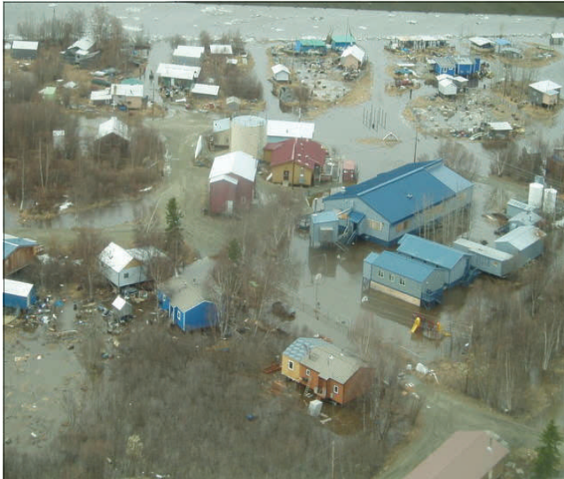
Former RFC Senior Hydrologist Dave Streubel flew to the village of Kobuk to observe ice jam flooding that occurred on the Kobuk River during this year's breakup.