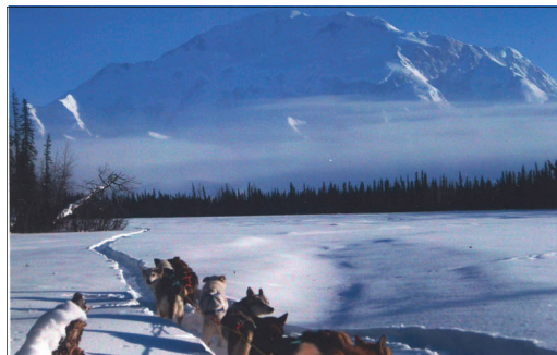
Lake Minchumina observer, Penny Green, drives her dog team to the base of Denali on the northwest side.