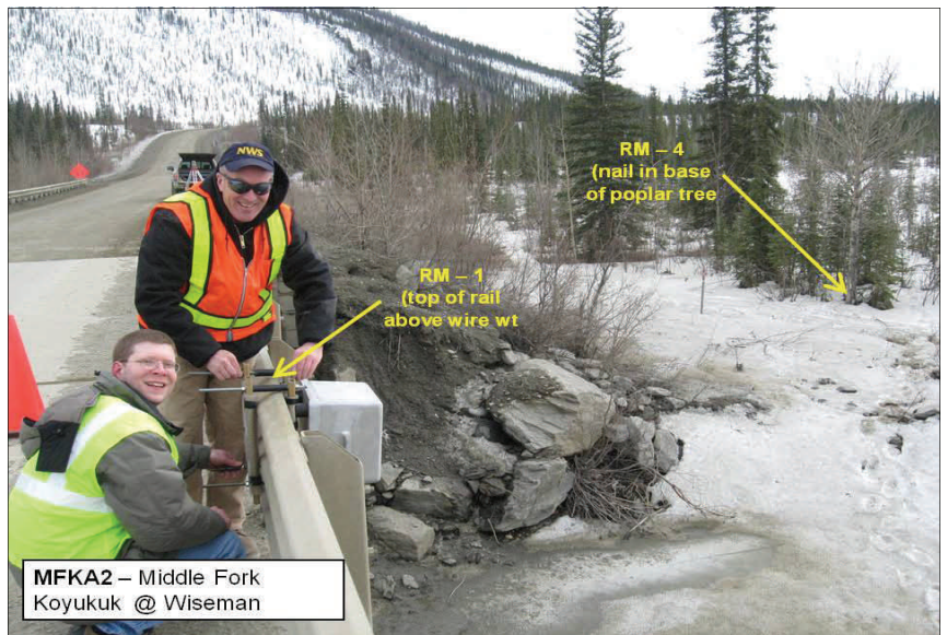
MFKA2 – Middle Fork Koyukuk @ Wiseman