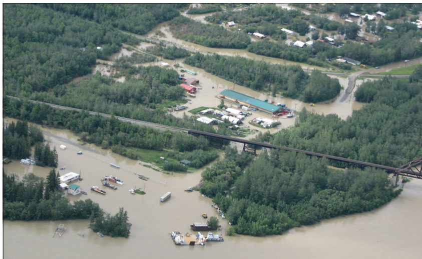
Floodwaters from the Tanana River inundate portions of Nenana.