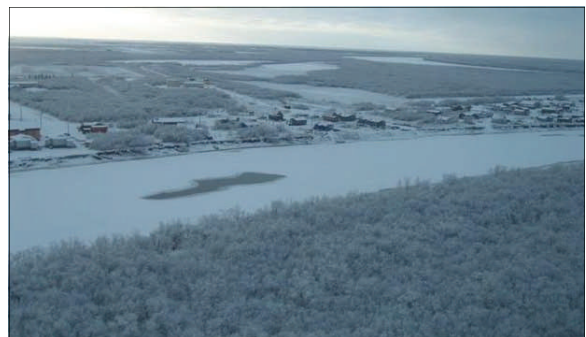
An open hole on the frozen Kuskokwim River in front of the village of Kwethluk - December 2007

We would appreciate any information on the condition of the river and the formation of river ice. Please complete the enclosed Freeze-up Form and return to us. Your help contributes to a more complete record of freeze-up data for Alaska and is greatly appreciated.