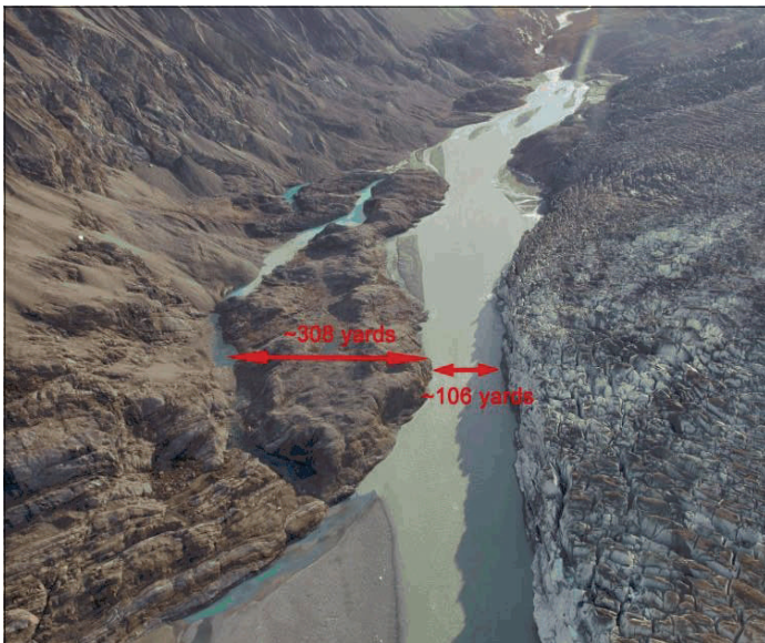
The Tweedsmuir Glacier is surging and threatening to block off the Alsek River to form a glacier dammed lake. The Alsek River originates in Canada, but flows through the northern portion of the Alaska panhandle. In this recent photo taken by the National Park Service looking downstream on the Alsek River, the Tweedsmuir Glacier on the right has closed the gap to about 100 yards wide. Once the glacier pinches off the river, a lake will begin to form above the blockage.