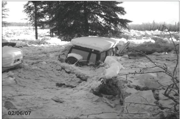
Car surrounded by ice following the release of Tazlina West glacier dammed lake

residents. The resulting ice breakup caused extensive flooding, with ice reportedly reaching nearly to the underside of the Richardson Highway bridge. Some homes along the river reported water up to the interior electric wall sockets. Besides inundation of an unknown number of homes, numerous cars, snow machines, and outbuildings were damaged or destroyed by ice. There