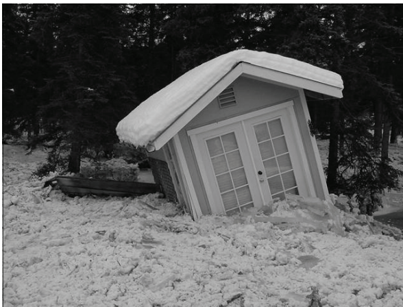
Damage to an outbuilding caused by the release of the Tazlina West glacier dammed lake

winter. This lake likely began to release in late January, but without an automated gage on the river, the initial rise in water level on the Tazlina River was not detected. Rising water levels went unnoticed until Saturday February 3 rd , when the ice breakup front that was caused by the rising water level progressed downstream to the Richardson Highway bridge and residences in the vicinity of the bridge. Water levels were reported to have risen very fast Saturday night, frightening the local