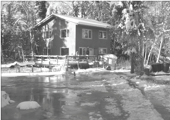
Overflow from Goldstream Creek surrounds a cabin near Fairbanks back in February

The cold and dry conditions resulted in considerable overflow icing of creeks and rivers during the winter. There were several reports of overflow inundating private property and causing groundwater levels to rise and dampen some home owners' crawl spaces. The excessive overflow ice has also kept the Department of Transportation busy trying to keep culverts thawed out and water from flowing over roadways. The abundance and thickness of ice on creeks and rivers does have some residents concerned that there may be a higher risk of ice jams during breakup. Fortunately the amount of water in the snowpack is low this year and the amount of runoff into the river systems will be much lower than normal.