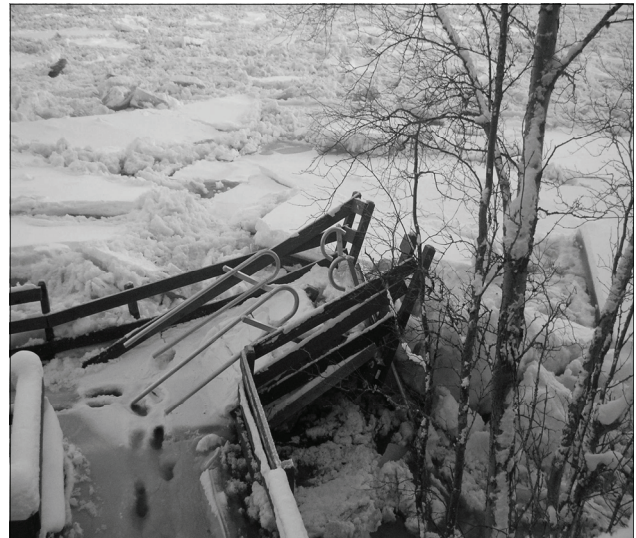
Damaged stairway at the Kenai River Center

release, we expected that it would release earlier than normal, but during open water season, in 2007. In open water conditions, the release of the Skilak glacier dammed lake typically causes a rise of several feet, but usually occurs in the fall when water levels are low, and thus is not a significant flood threat. In mid January an otherwise unexplained rise in river levels was indicated by the stream gages and was confirmed by river observers. The