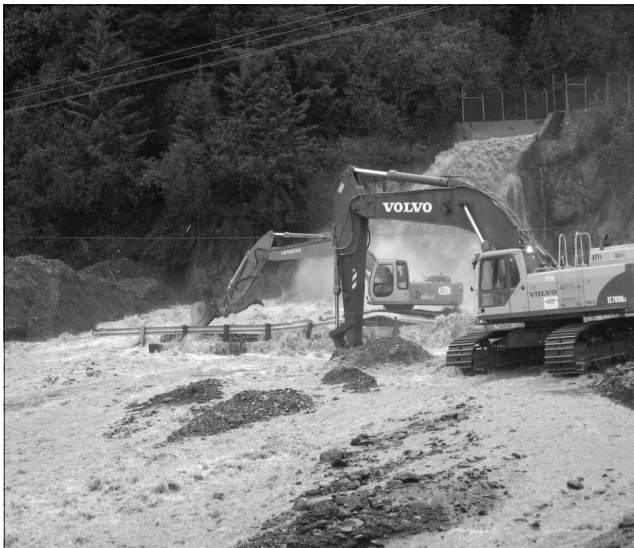
Lowell Point in Seward