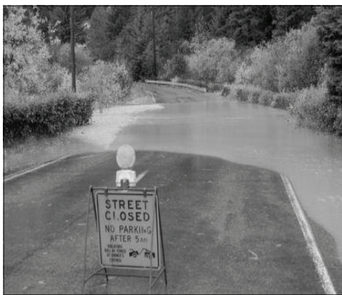
Heavy October rains caused flooding in the city of Seward