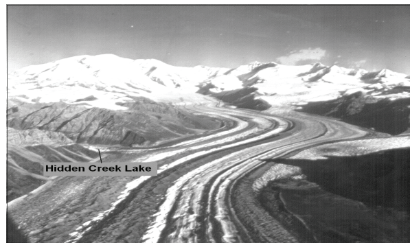
Hidden Creek glacier dammed lake