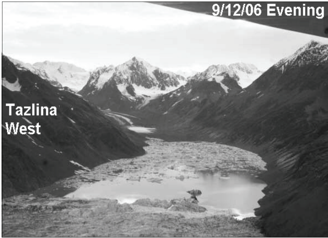
Tazlina West glacier dammed lake

Nelchina South Lake, dammed by the Nelchina Glacier, released during September of 2006. The other large lake, dammed by the Tazlina Glacier, is called Tazlina West or Tazlione Lake. This lake was reported to be pretty full in September, but did not release before