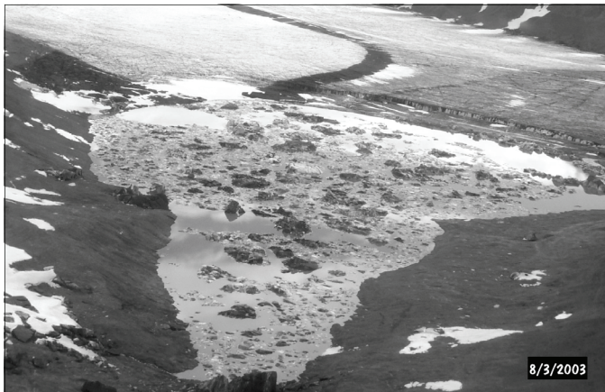
Skilak glacier dammed lake

The Skilak glacier dammed lake in the Kenai River basin was expected to release in the fall of 2006, since its previous release was in October of 2004 and the lake typically has a 2 to 3 year filling cycle. When it did not