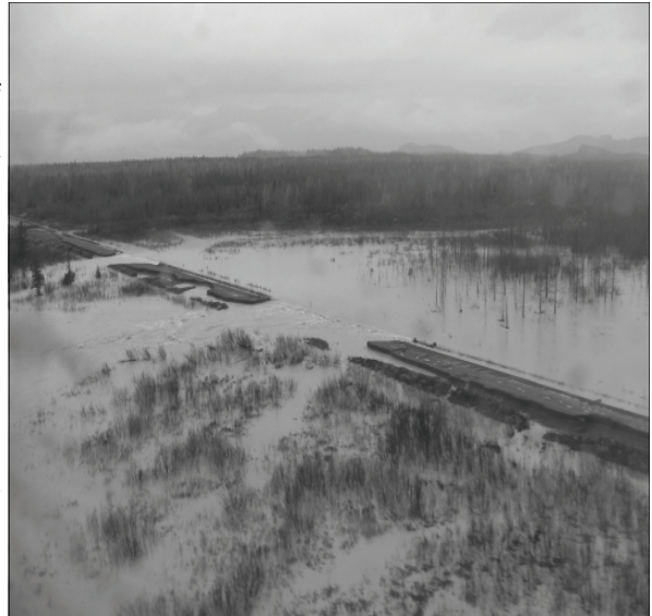
Copper River Hwy washouts near Sheridan River

Gauged streams in the Seward area crested 1.3 to 2.4 feet above flood stage in the afternoon of October 9 th . Eyak River in Cordova crested 3.5 feet above flood stage during the afternoon of October 10 th . Significant road damage was incurred on the Richardson Highway south of Tonsina. Other areas affected by the event were mountainous areas of southwest Alaska, and the Susitna River valley.