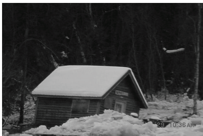
Damaged cabin on the Kenai River

release, we expected that it would release earlier than normal, but during open water season, in 2007. In open water conditions, the release of the Skilak glacier dammed lake typically causes a rise of several feet, but usually occurs in the fall when water levels are low, and thus is not a significant flood threat. In mid January an otherwise unexplained rise in river levels was indicated by the stream gages and was confirmed by river observers. The