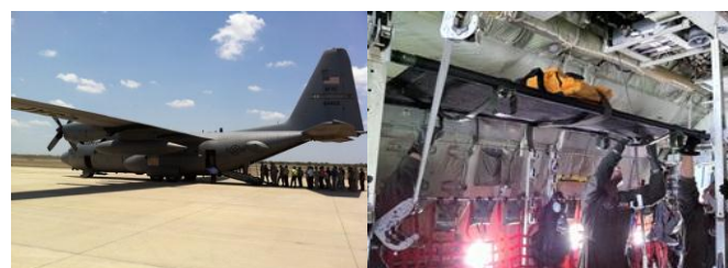
Left: C130 transport used for medical needs evacuation at McAllen/Miller International Airport. Right: Inside the C-130, showing an example of a “bunk” where patients would lie during transport. At least 35 patients can be transported securely in each specially outfitted C-130.

Hurricane “Barry”, designed by WCM Goldsmith and based on major Hurricane Allen (1980), showed how clearly communicated weather information is used to make large scale and often expensive decisions to ensure public safety for a growing population with abundant functional and medical needs.