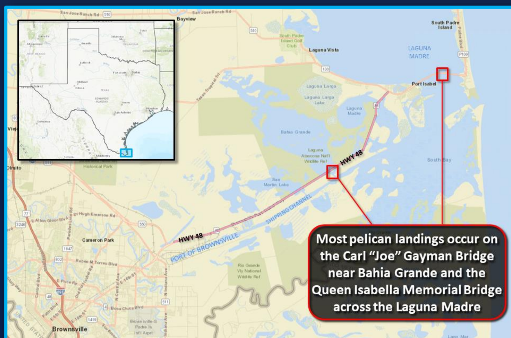
LEFT: State Highway 48 and common pelican event areas.

After large pelican losses during the 2013-14 winter season, TxDOT installed multiple 8 foot tall poles every 15 feet along favored pelican landing areas, including Texas State Highway 48, the main route between Brownsville and South Padre Island, in an attempt to deflect birds from landing on bridges. Other efforts to alert motorists about the possible pelican hazard prior to and during these events include road signs (mobile and permanent), news articles and reports, weather briefings, and social media posts.