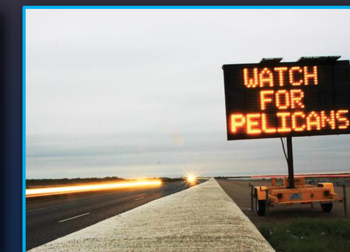
Volunteers, Texas Wildlife officials, and members of law enforcement work to save pelicans on December 6 th, 2017, while alerting passing motorists.