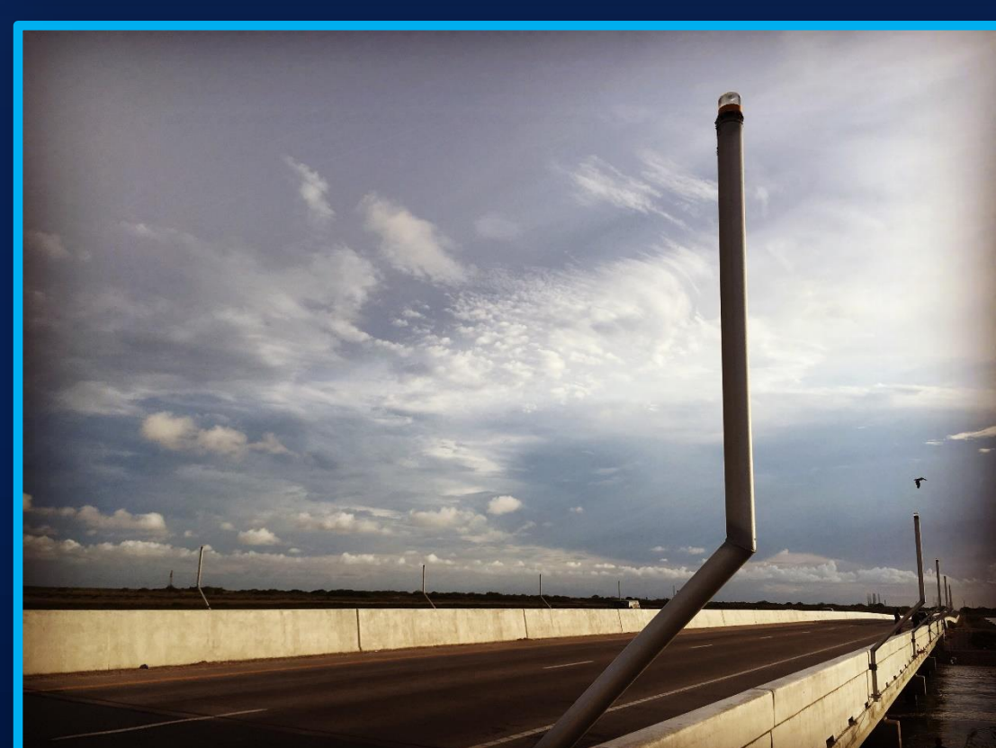
BOTTOM LEFT: Bird and pelican deterrent poles installed along either side of the Carl "Joe" Gayman Bridge near Bahia Grande – known pelican roosting grounds.