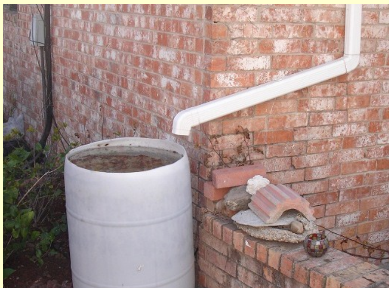
Left: A homemade 55 gallon plastic rain barrel found in the Rio Grande Valley.

http://www.twdb.state.tx.us/publications/reports/RainwaterHarvestingManual_3rdedition.pdf