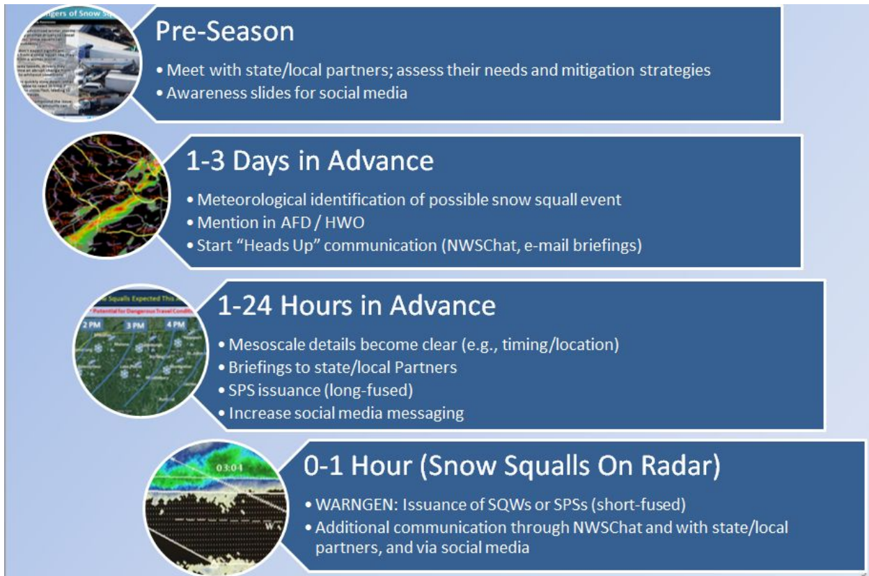
Figure 3. A summary (from NWS training slide) of potential NWS actions (“Ready-Set-Go” philosophy) at various time scales leading up to snow squall events and issuance of SQWs within 1 hour of occurrence. NWS text product acronyms include the Area Forecast Discussion (AFD), Hazardous Weather Outlook (HWO), and Special Weather Statement (SPS). NWSChat refers to instant messaging software used by NWS personnel to exchange critical warning decision expertise and other types of significant weather information essential to the NWS’s mission of saving lives and property with the emergency management and media communities.