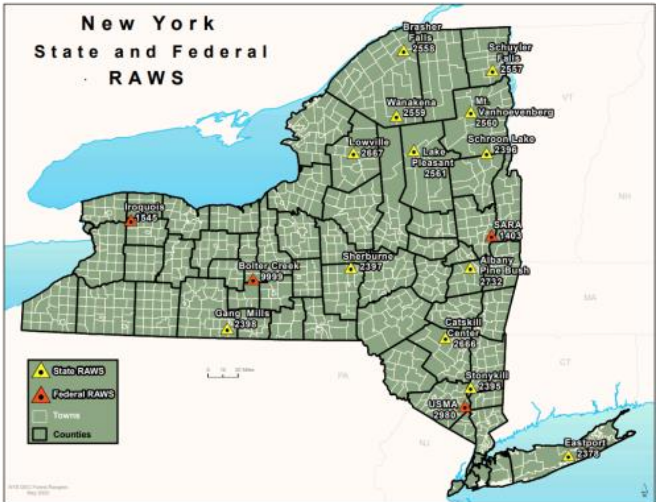
RAWS Map:

FUELS/FIRE DANGER: New York State DEC Predictive Services issues a statewide Fire Danger Rating Area Risk Forecast covering Day 2. When forecast fire danger levels reach critical levels, NYS DEC should coordinate with NWS offices. Link to this forecast: