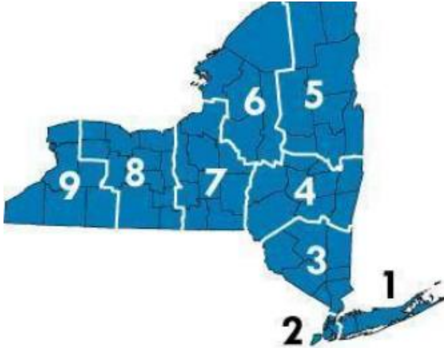
NY DEC REGIONS MAP

DEC Contacts as of March 2024: (see https://www.dec.ny.gov/about/667.html for updates)