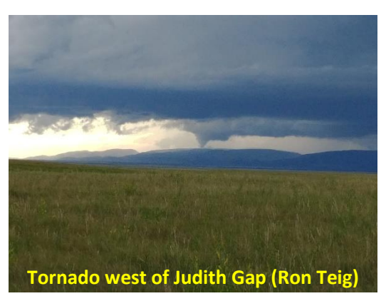
June 27: A tornado was observed for a brief time in a rural area

about 12 miles west of Judith Gap (no damage reported). This well-