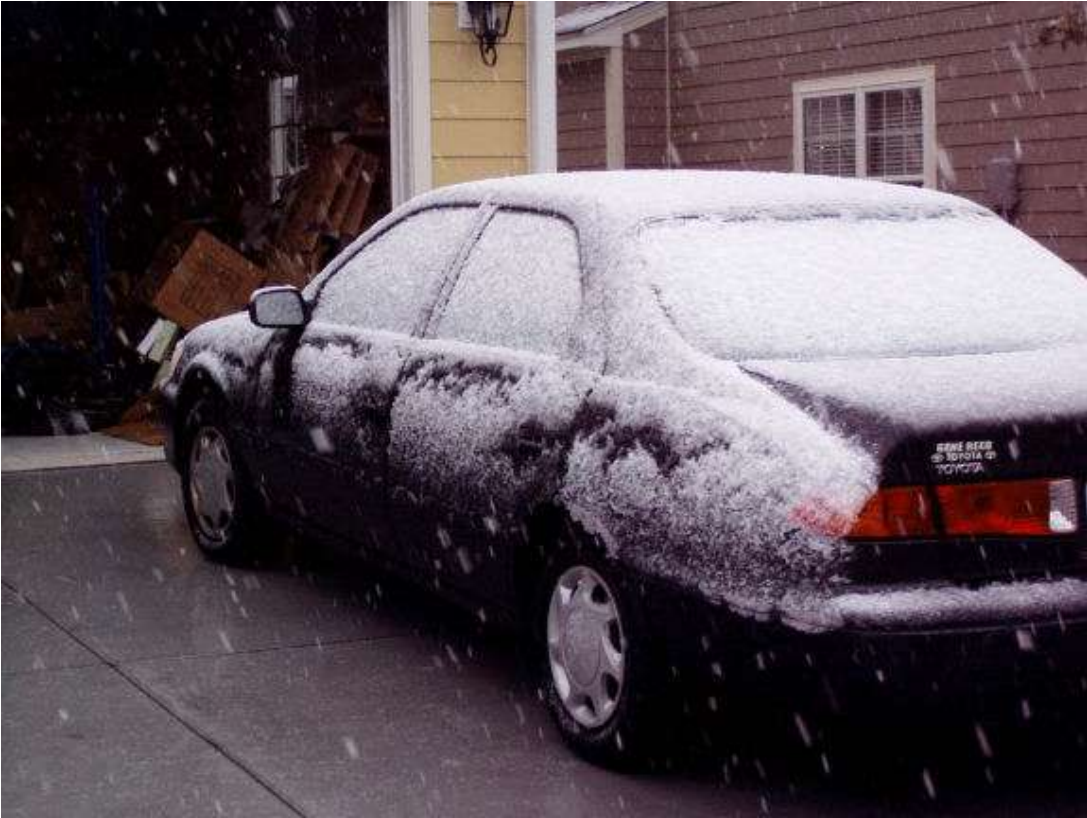
Daniel Island, SC