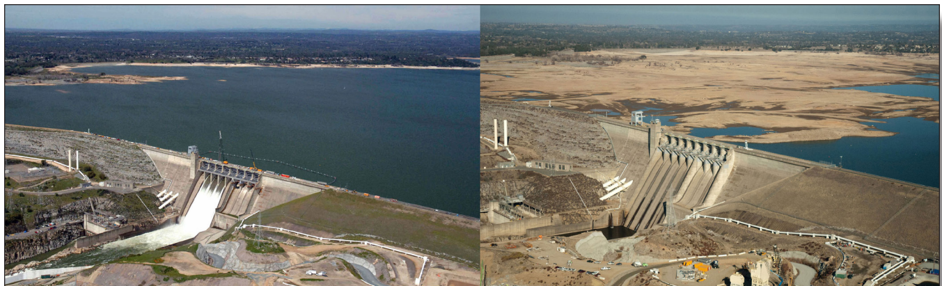
Folsom Lake - July 20, 2011