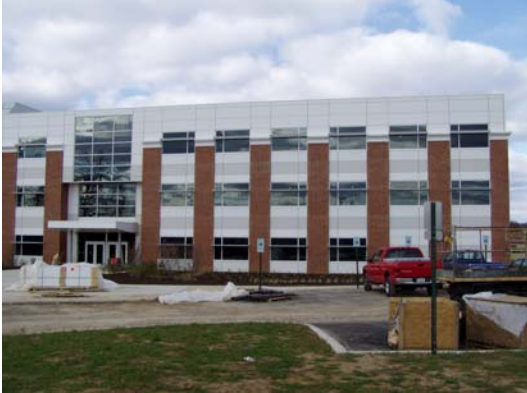
Picture of our new office. We will be located on the top floor.

As always, we look forward to receiving calls with information about ongoing storms. Our number hasn't changed, so please don't hesitate to call us at: 1-800-697-0010.