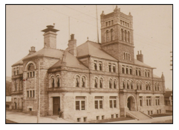
Old Post Office building, downtown Duluth, circa 1895. (This building no longer exists.)

■ 1890: The "Organic Act" of 1890 established the U.S. Weather Bureau as a civilian agency under the Department of Agriculture.