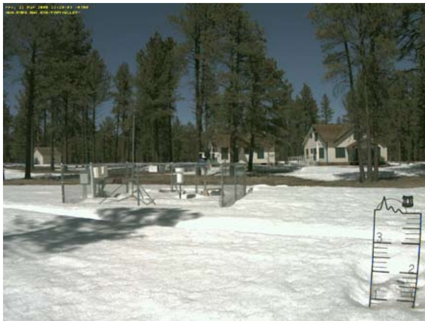
FVEF weather station as it is now. March 21, 2008.