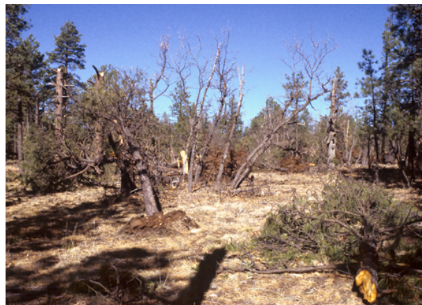
Figure 5. Portion of the damage path from the 14 October 2006 tornado in northern Arizona. At this location, the damage path went through both softwood and hardwood trees.