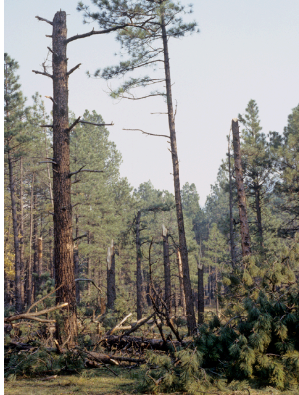
Figure 2. Portion of the damage path from the 14 October 2006 tornado in northern Arizona. Note the variation in damage to trees with snapped trunks next to undamaged trees.

undamaged trees all within a few tens of meters of each other. Assigning a reasonable and appropriate DOD is challenging and the result could be a rating of anywhere from low-end EF0 to upper-end EF1. In these locations, the expected value (EXP) for the most prevalent DOD was used to assign an EF value.