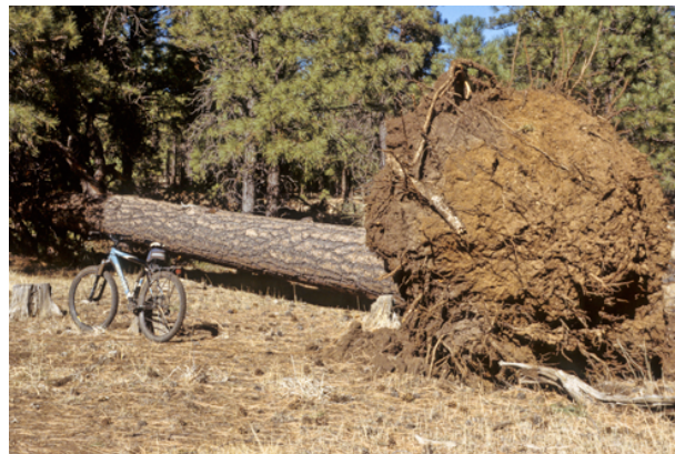
Figure 6. A mountain bike was a necessary means of transportation through much of the forest owing to poor quality roads and toppled trees blocking roads.