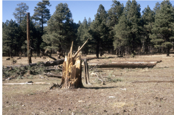
Figure 4. Portion of the damage path from the 14 October 2006 tornado in northern Arizona. This open field was the site of the strongest damage with an EF2 rating.

Of equal importance was the larger-scale pattern of damage in many of the surveys. Uprooted trees and snapped trunks usually displayed an asymmetric damage pattern. Modeling and analytic studies have