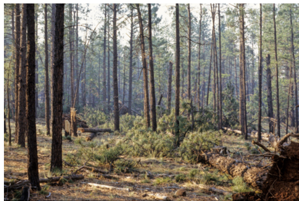
Figure 3. Portion of the damage path from the 14 October 2006 tornado in northern Arizona. Note the variation in damage with trees with snapped trunks next to toppled trees and all in proximity to undamaged trees.