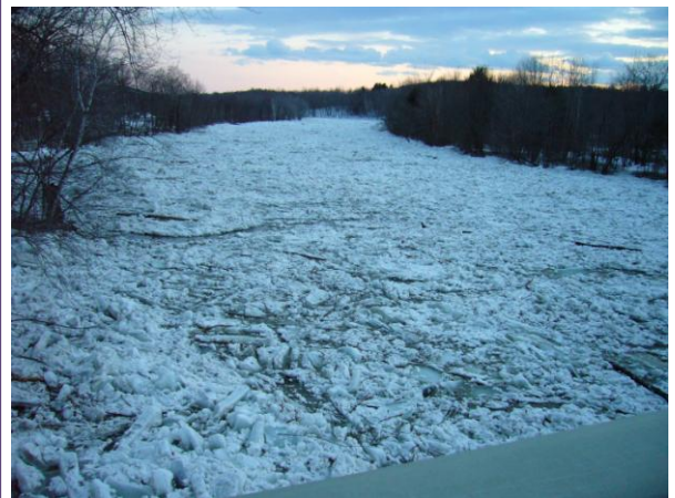
Ice Jam on the Sandy River in Farmington, ME in January 2010

Flood Statement: Used to issue a Flood Advisory, if flooding is of a minor nature or just a nuisance.