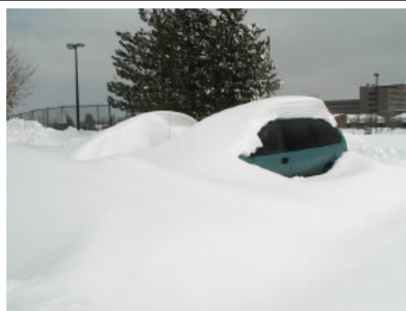
Snow Covered Parking Lot in Martinsburg, WV on Feb 20th

In February, the snow machine went into overdrive. A major snowstorm pounded the city between the 15th and the 18th. The 28.2 inches that accumulated made it the greatest snowstorm ever recorded in Baltimore. February ended up being the snowiest month ever with just over forty inches falling in only twenty-eight days. Snow covered the ground for 31 days this winter, the most since 1960. In addition, a major rainfall event followed right after the record snowstorm. Rain fell from February 21st through the 23rd and dumped more than two and a half inches of rain in just 24 hours.