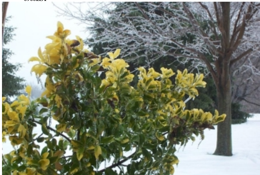
Ice accumulation on trees and bushes in Jacksonville, Baltimore County

11 0000EST 0900EST 0 0 Winter Weather/Mix