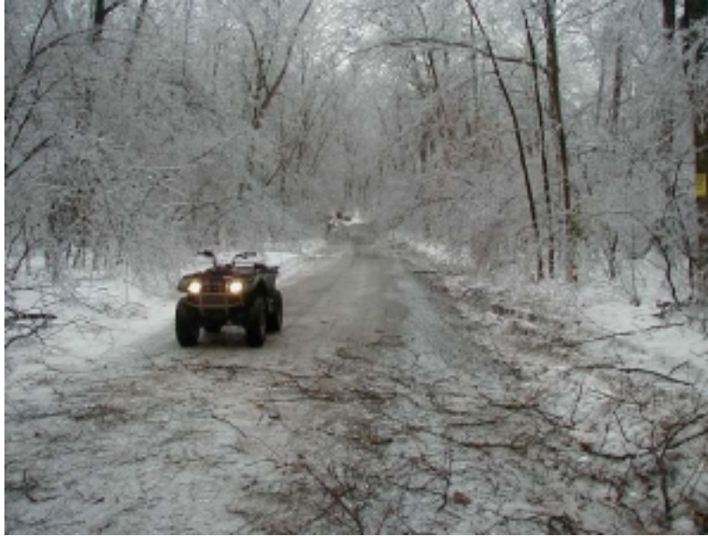
View of a country road on the Virginia/West Virginia border on the morning of December 11, 2002

An area of low pressure that tracked across the region on the 11th produced between 1 and 2 inches of rainfall. Unfortunately while rain was falling during the morning hours, ground temperatures were below freezing across the Eastern Panhandle of West Virginia. This caused the rain to freeze on contact with the ground and several locations reported ice accumulations between 1/4 to 1/2 inch. Roads and sidewalks became treacherous and numerous trees and power lines were downed by the heavy ice accumulations. Nearly 8,500 customers in Berkeley and Jefferson counties lost power as a direct result of the storm. A few severe slip and fall injuries were reported during the ice storm in Berkeley County.