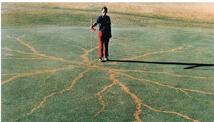
Lightning discharge on a golf green.