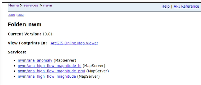
Figure 2: Subset of services found in the “nwm” folder.

The NWS FIM services can be found in two folders: nwm and rfc (“nwm” stands for National Water Model and “rfc” stands for River Forecast Center). The FIM derived from the NWM Analysis and Assimilation configuration and from the 5-day NWM forecast can be found in the “nwm” folder. The FIM derived from the 5-day RFC forecast can be found in the “rfc” folder. A subset listing of services within the “nwm” folder can be seen in Figure 2.