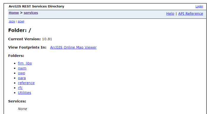
Figure 1: Folder structure for NWC Visualization Services and NWS FIM Services found at https://maps.water.noaa.gov/server/rest/services .

Following the link above, one will find that the public HydroVIS services are organized into folders as seen in Figure 1. These services span two NWS product/service lines: the National Water Center (NWC) Visualization Services and the NWS FIM Services. This document provides information focused on access to the FIM Service. The http://www.weather.gov/owp/operations page has more information on the NWC Visualization Services, and also includes reference and other information on the FIM Services.