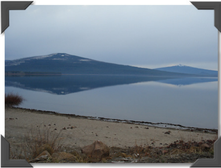
Wickiup Reservoir, with Davis Mountain (left) and Maiden Peak (right) to the south.