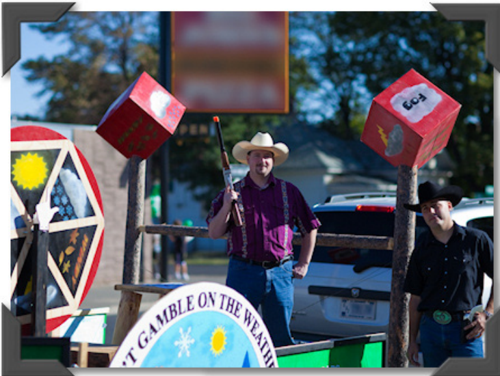
Round-Up parade in Pendleton. By T.W. Earle