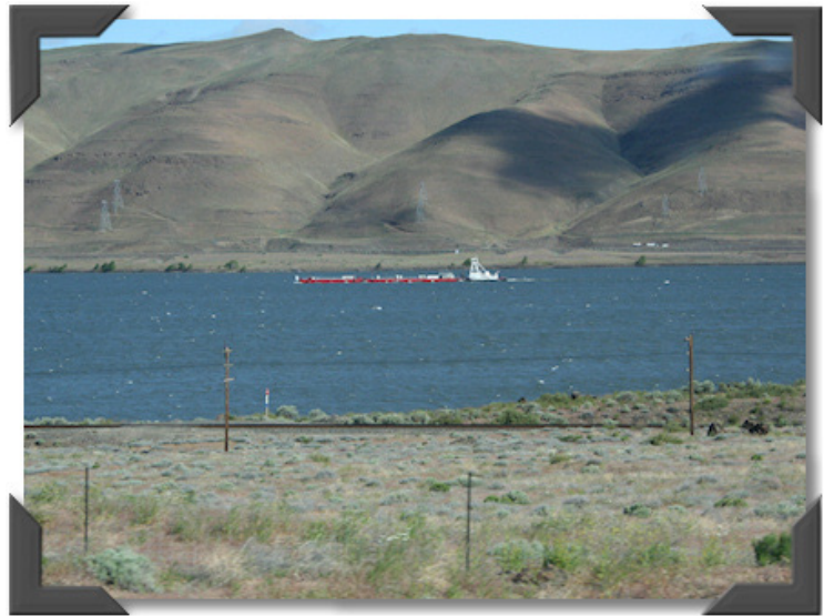
Barge on the Columbia River