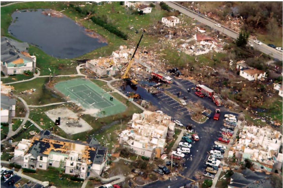
Several apartment buildings were damaged in the Country Garden Apartment complex in Winter Garden, Florida.