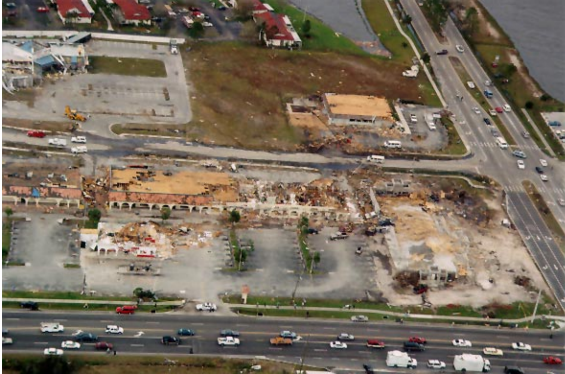
Substantial damage to the Boggy Creek Shopping Center on the east side of Kissimmee, Florida.