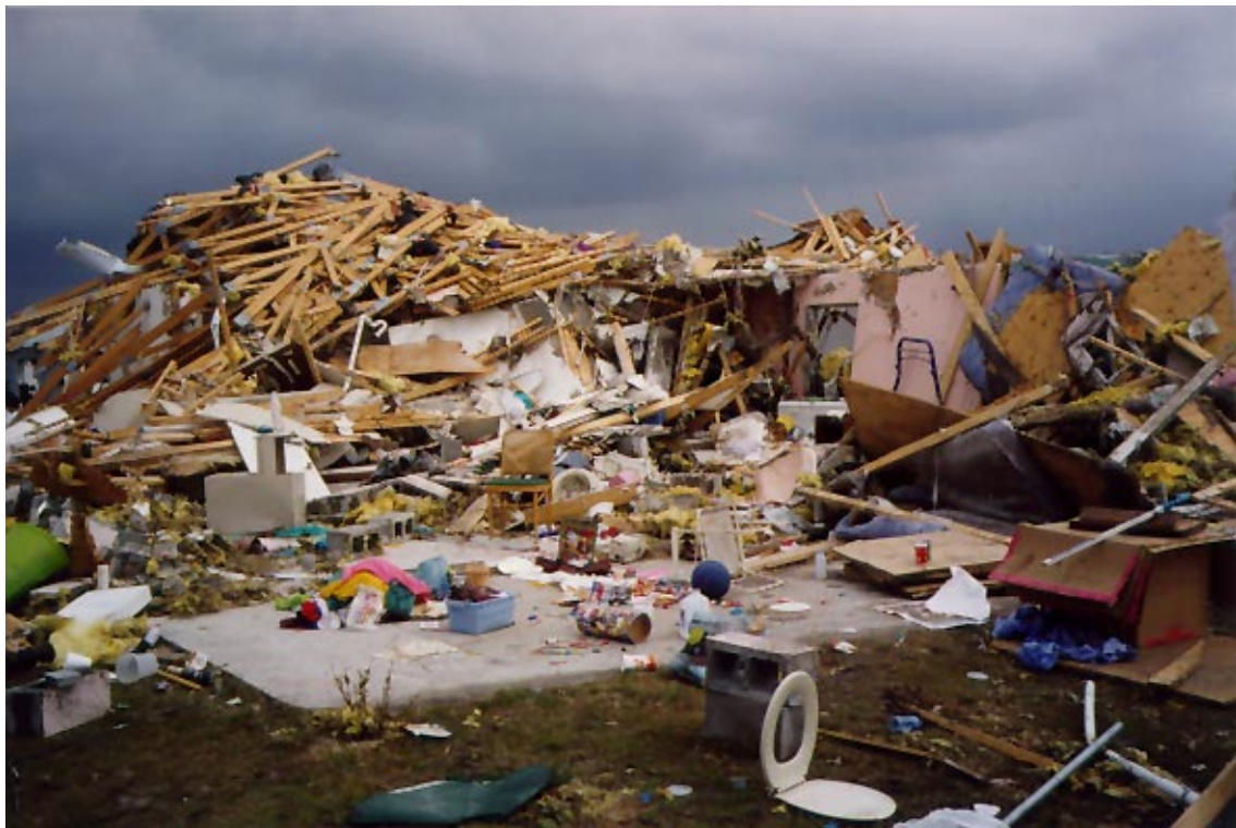
While there was significant structural damage to a block home in the Lakeside subdivision in Kissimmee, Florida, no fatalities occurred in this area.