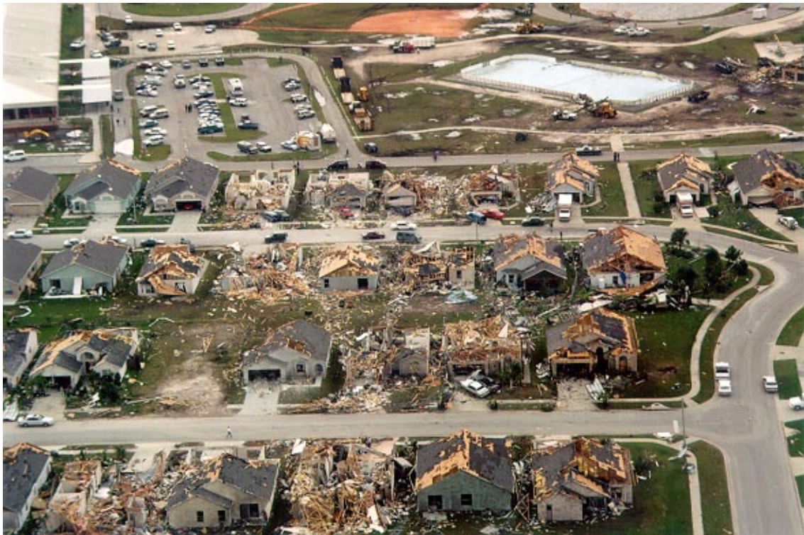
Aerial view of damage to homes in Lakeside subdivision in Kissimmee, Florida. The tornado moved from the upper right to the lower left, narrowly missing a school.