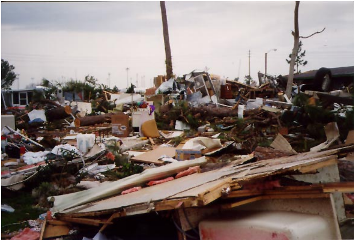
Extensive damage to mobile homes and recreational vehicles at the Ponderosa RV Park in Kissimmee, Florida. Main office building on extreme right of photograph received minor roof damage.