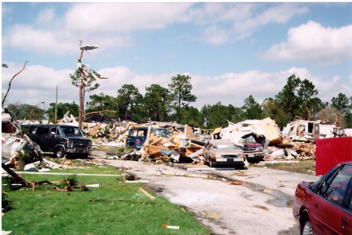
Nearly total devastation occurred in a narrow corridor through Ponderosa RV Park in Kissimmee, Florida. Multiple fatalities occurred at this location.