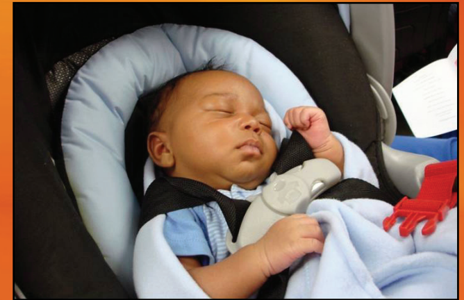
NEVER leave a baby, senior or pet locked in a car, even for a few minutes. Dozens of infants and untold numbers of pets die every year in hot vehicles.