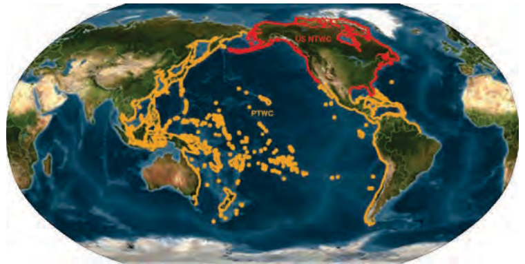
Coverage areas for NOAA's two tsunami warning centers: National Tsunami Warning Center (red) and Pacific Tsunami Warning Center (yellow)

NOAA operates two tsunami warning centers, which are staffed 24 hours a day, 7 days a week. The two centers monitor for tsunamis and the earthquakes that may cause them, forecast tsunami impacts and issue tsunami messages.