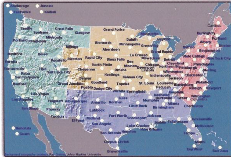
Figure 1: The National Weather Service operates 122 Weather Forecast Offices in six regions. Each Weather Forecast Office has a geographic area of responsibility, also known as County Warning Forecast Area, for issuing local public, wildfire, marine, hydrologic and aviation forecasts and warnings.

Coordination Meteorologists (WCMs) at each of the 122 NWS Weather Forecast Offices (WFO) in the US (Figure 1) or independently as non-regulated individual chapters or groups. This presents a number of challenges to streamlining and standardizing the reporting and training of weather spotters across the country.