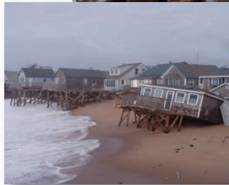
Storm forecast media interview