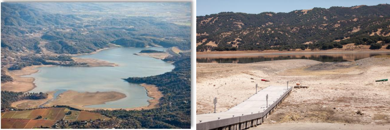
Lake Mendocino: Aerial view and plane view