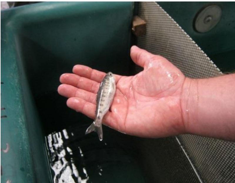
Juvenile Coho Salmon

Related to this priority area, NOAA's Habitat Blueprint initiative is currently providing funding to several projects in the Russian River Basin for habitat protection and restoration for salmonid stocks; improving frost, rainfall, and river forecasts through improved data collection and modeling; and increasing community and ecosystem resiliency to flooding and drought through improved planning and water management strategies. In addition, SCWA has a plan in place to restore endangered fisheries (Russian